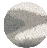
High and Low Loop