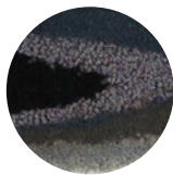
Multilevel Cut and Loop