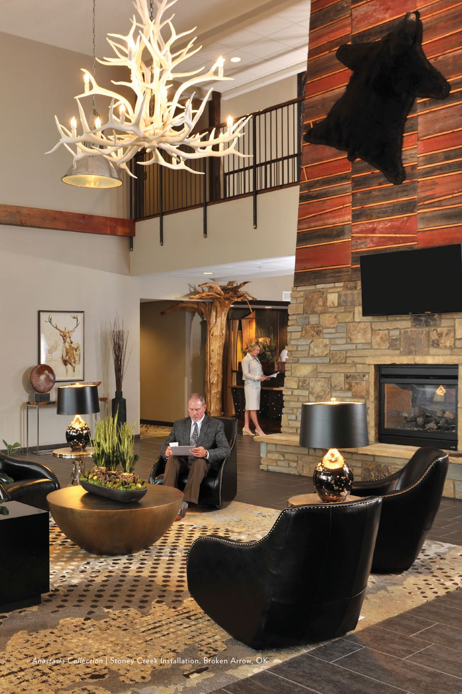
Anastasia Collection | Stoney Creek Installation, Broken Arrow, OK