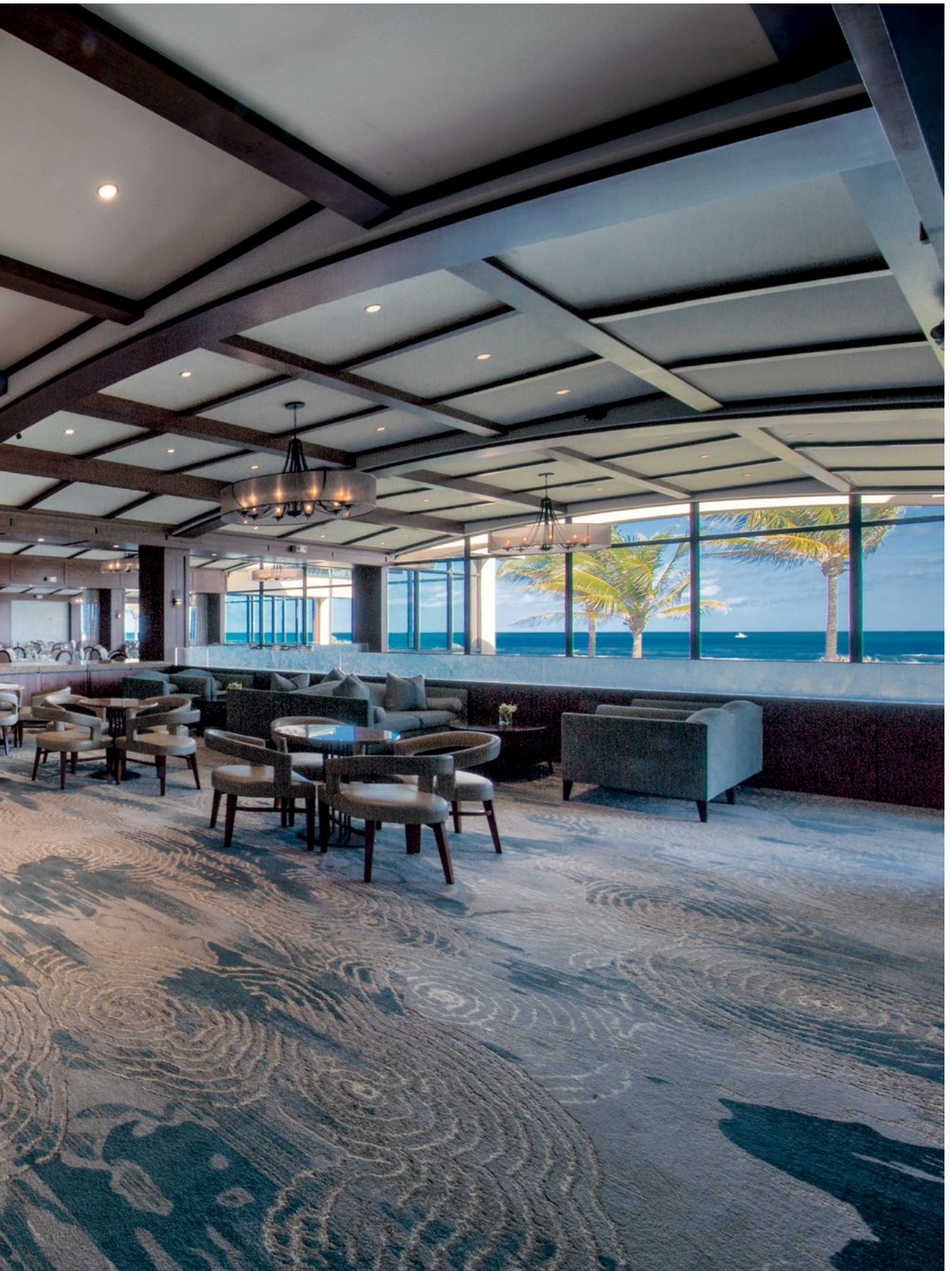
Sailfish Point Country Club, Stuart, FL